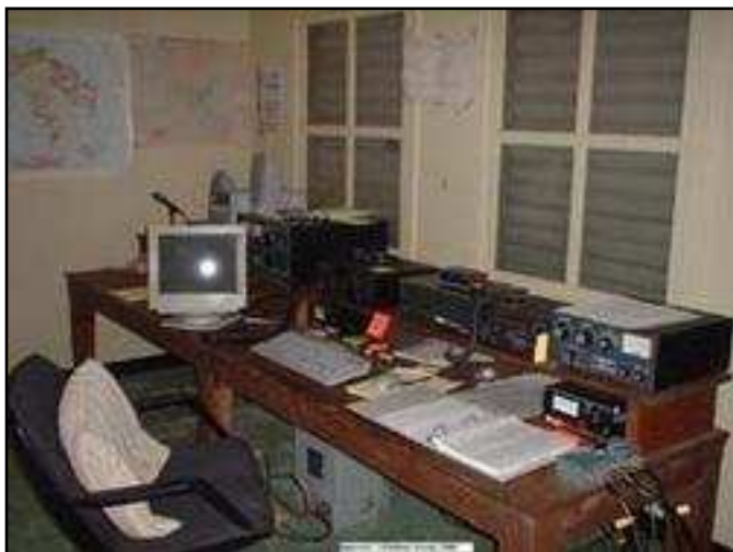
The Amateur Radio station at Guantanamo.

The 40 call signs having the first two letters AF, KF, NF or WF and the letters "EMA" following a numeral are available to the Federal Emergency Management Agency (FEMA).